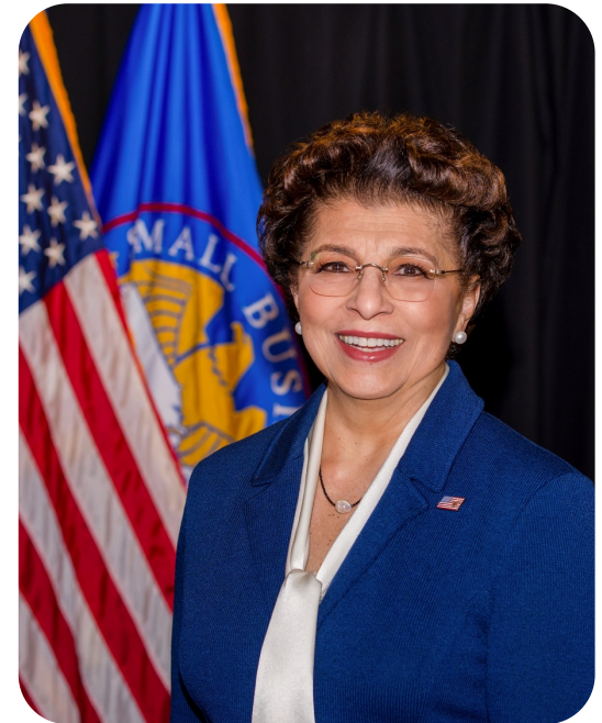
Administrator Jovita Carranza

*As provided by the Coronavirus Preparedness and Response Supplement Appropriations Act that was recently signed by the President.